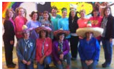
The wonderful teachers at Northport Elementary

Alabama One and its Adopt-A-School partner, Northport Elementary School, have worked very hard this quarter with special projects and events. The annual "Crazy Hair Day" was one such event. For the privilege of donning a crazy hairdo for the day, students donated $1, and the $384 raised provided a special Thanksgiving meal for 7 families in the community.