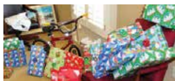
Gifts wrapped and ready for delivery.