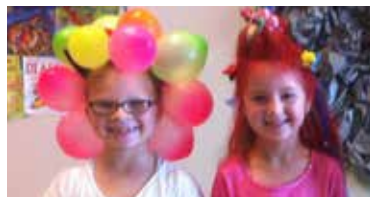
Top winners of "Crazy Hair Day"