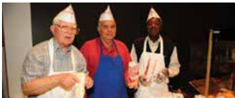
Great moments from the 7th annual Moola Festival