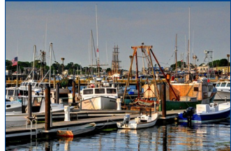
Historic Gloucester "America's Oldest Seaport"