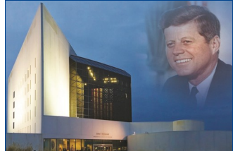
JFK Library & Museum