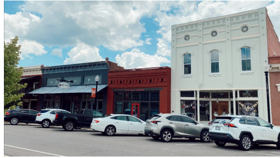
East Choccolocco Street c. 1979 (left) and 2023 (right).