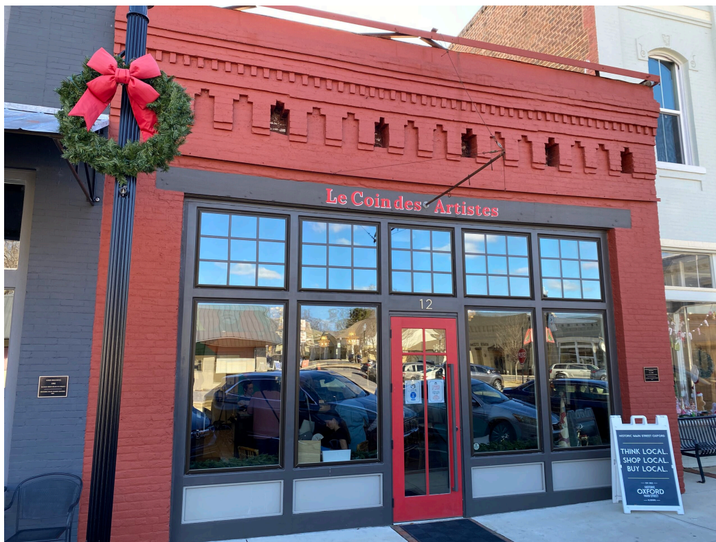
HUBBARD PIANO COMPANY BUILDING