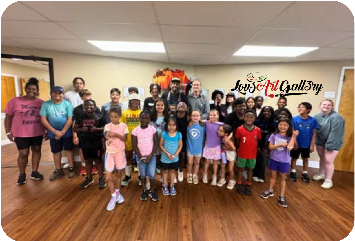
Group photo after an art immersion class with Lov3Art Gall3y LLC