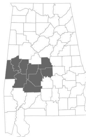
THE WCCS SERVICE AREA, AL