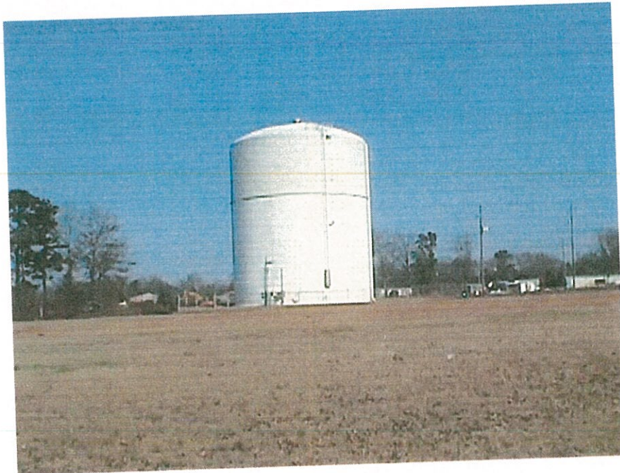
Montgomery Highway Tank

Elevation 390 FT. Height 80 FT. Diameter 66 FT