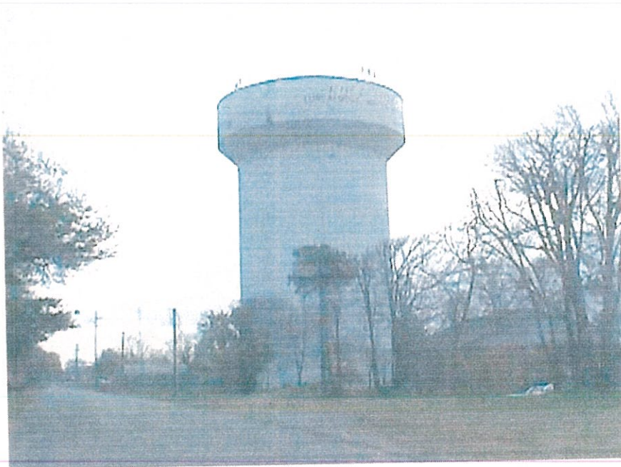
29th Street Tank

Elevation 360 FT. Height 155 FT. Diameter 100 FT